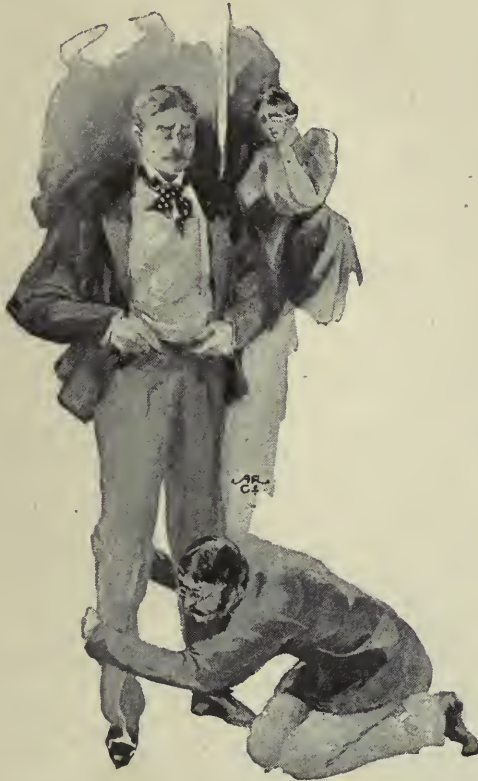
MR. BUX PROSTRATED HIMSELF

with touching Oriental humility, at my nephew's feet, and copiously embraced them. 'Get up!' shouted Vernon heartlessly. 'Aunt Vinnie, this is a matter——'